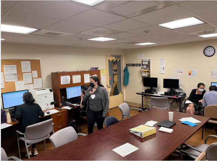
Computers for use are in the team rooms on each unit