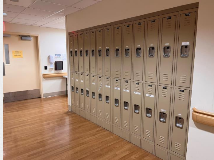
Secure conference room, (Child Psych Unit); Secure team rooms (for Adult Psych rotators in Clark 8)