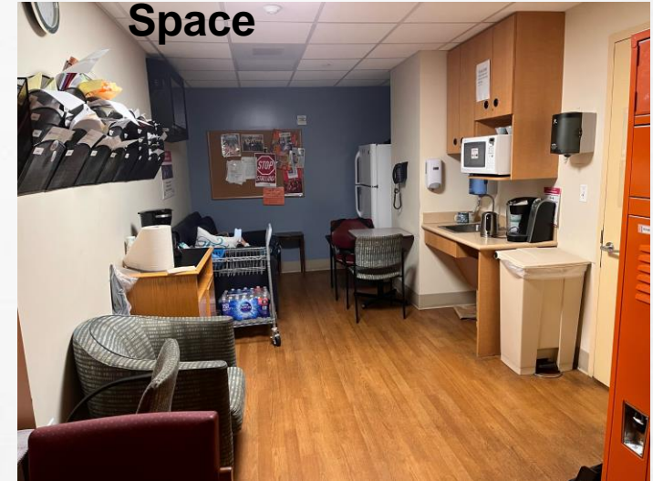
Library on the 8th floor of the Clark building; Cafeteria and Café can also be used for Breaks